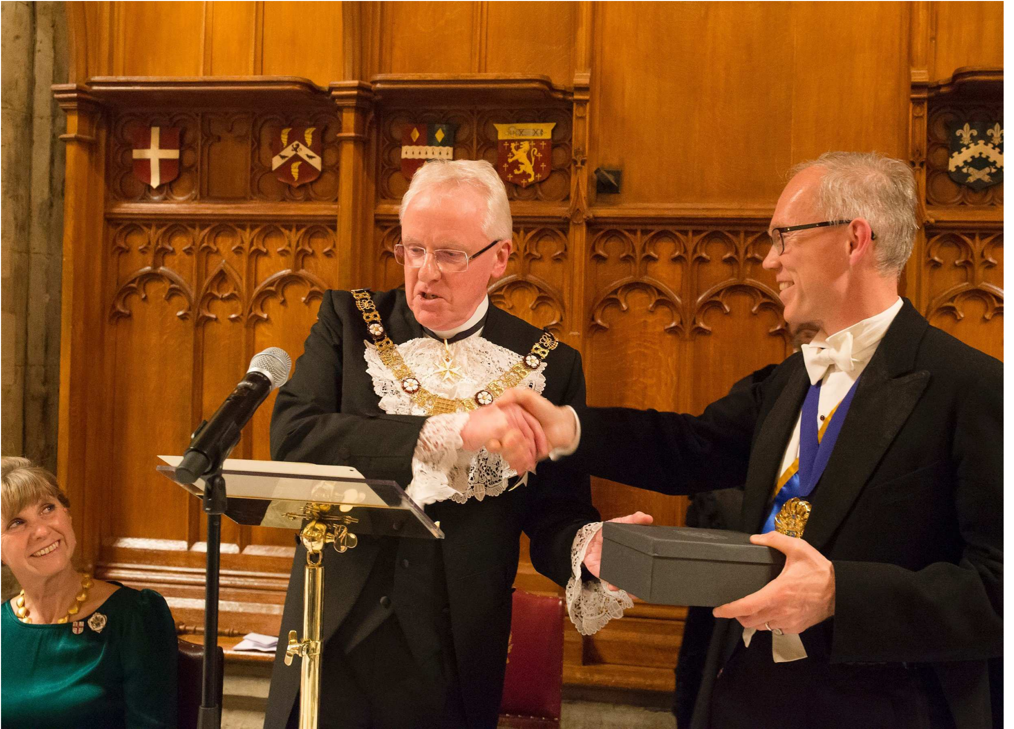
The Lord Mayor presented a pewter gift to the Master